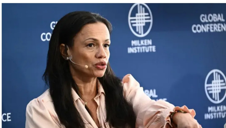
Alexis McGill Johnson, president and CEO of Planned Parenthood Federation of America, unveiled a new suite of judicial reform priorities on Sunday, court packing among them.

Democrats and pro-choice groups have widely espoused the idea of court packing in the months since the fall of Roe v. Wade .