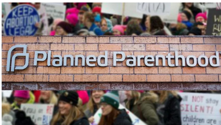
Planned Parenthood has released a new platform to call for court packing and term limits for the Supreme Court, among other priorities.