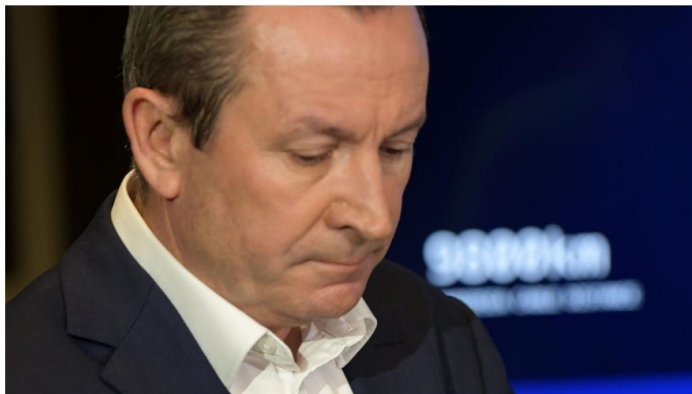
A number of threats has been issued against Mr McGowan over his Covid-19 policies.

It was far from the only "un-Australian" acts that were carried out as politicians across the country rolled out Covid-19 vaccinations.