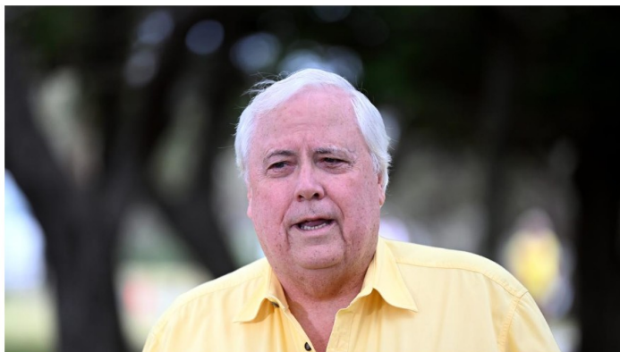
Mr Palmer pursued the WA government and Mr McGowan personally with legal fights throughout the Covid-19 pandemic.

Both men came out as the losers of their bitter defamation trial after they sued each other in the NSW Federal Court, with $5000 in damages awarded to Mr Palmer and $20,000 to the Premier.