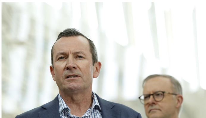
Though he has plenty of followers, the premier has also experienced his fair share of hecklers.

A woman attempted to get in the way of the premier and his security, demanding he "give us our jobs back".