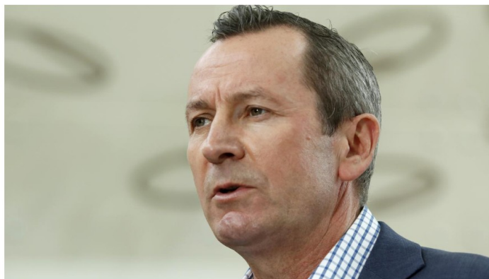
Mr McGowan has served in Parliament for 26 years as the Minister Rockingham.

"This job is like no other. After seven elections across nearly three decades, now is the right time to step away from the job that I have loved."